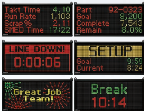
Flip screens automatically based on what's happening on the plant floor.

Every production situation is unique. That's why XL makes it especially easy to select the metrics that are most meaningful for your plant floor. With 100+ metrics available “out of the box”, XL easily adapts to your needs. Plant floor events are immediately reflected on the XL Visual Display, providing a direct link between action (line goes down) and reaction (operator resolves problem).